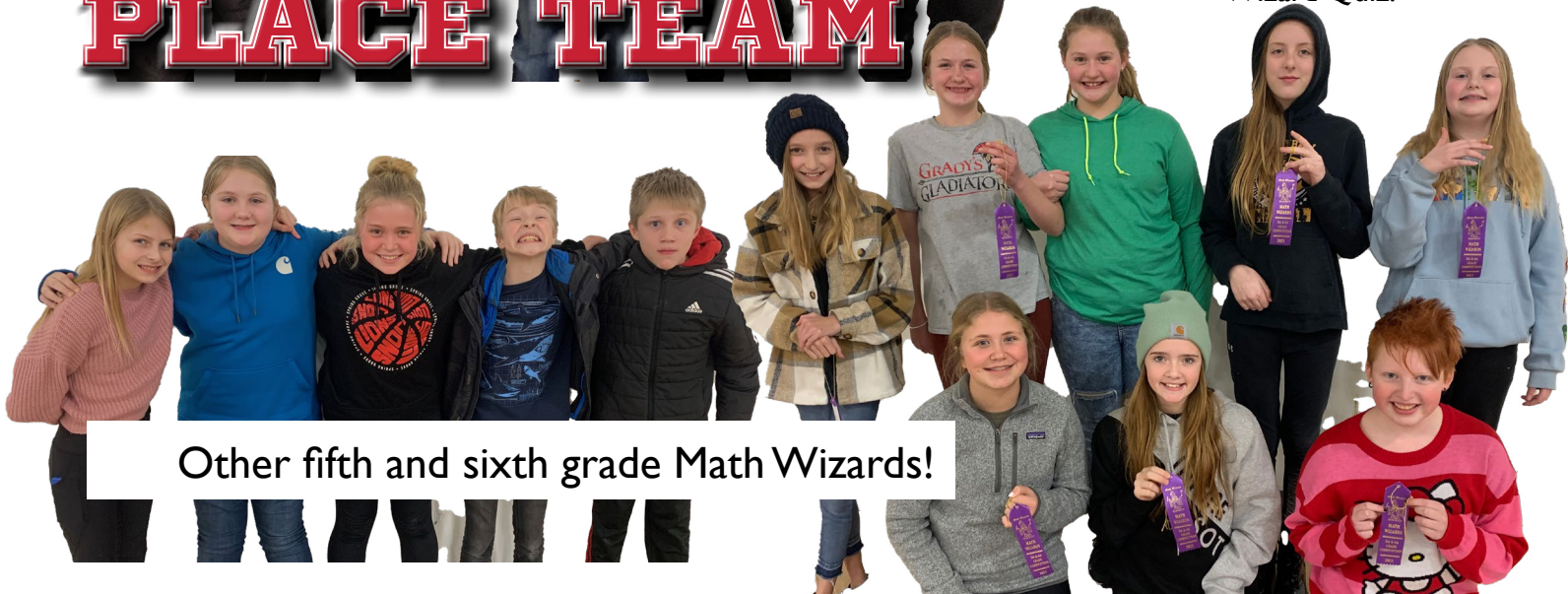
Other fifth and sixth grade Math Wizards!